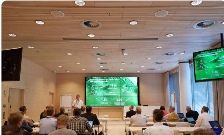
Figure 1. Example of Twitter activity done during Business Forum seminar

After the Business Forum part all presentations were shared to Luke's Slideshare channel to be available for further use. Presentations can be found here: